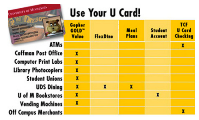
Marketing TCF's U Card at the University of Minnesota

As one example, TCF Bank has alliances with the University of Minnesota, the University of Michigan, the University of Illinois and two other colleges. These alliances include exclusive marketing, naming rights and other agreements. Branches have been opened on many of these college campuses. TCF provides multi-purpose campus cards for many of these colleges. Its cards serve as a school identification card, ATM/debit card, library card, security card, health care card, phone card and stored value card for vending machines or similar uses. TCF is ranked 5th largest in number of campus card banking relationships in the U.S. On December 31, 2011, the bank held $274.3 million in campus deposits. TCF has a 25-year naming rights agreement with the University of Minnesota to sponsor its on-campus football stadium, "TCF Bank Stadium," which opened in 2009.10