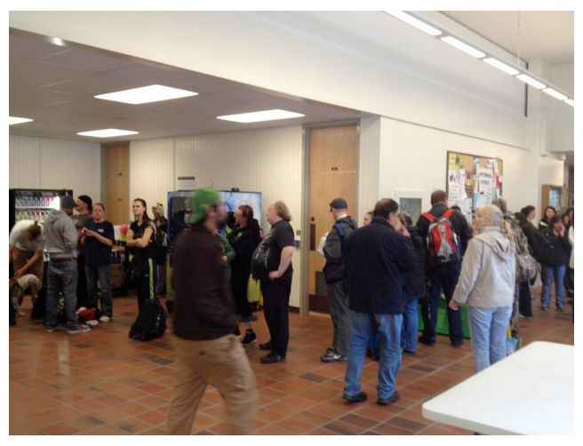
Line at the one of the two Higher One ATMs at Lane Community College (OR) as spring quarter classes start, April 2012. Line continues in both directions where picture ends, totaling around 50 students. Both ATMs ran out of money by lunchtime.

The Department of Education has established rules that prohibit fees to access student aid money disbursed to a debit card on ATMs as long as the issuing bank provides conveniently located fee-free ATMs.<sup>21</sup> However, the rules specifically allow the bank to charge foreign ATM fees when students use other machines. The current rules do little to define what "conveniently" located means in terms of location or number of ATMs, as well as cash availability in the ATMs when disbursements arrive. The rules do not protect students from situations in which they are charged money to access their aid funds. The rules do not protect students from changing terms and conditions that impact fee structures and can affect their ability to access their aid freely and conveniently.