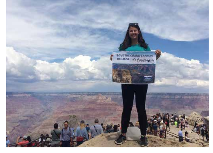
Staff collect photo petitions at the Grand Canyon in support of its permanent protection from toxic uranium mining.

The Grand Canyon is too important to destroy with toxic mining. More than 600 uranium mining claims surrounding the park, some as close as 10 miles from the park boundary,